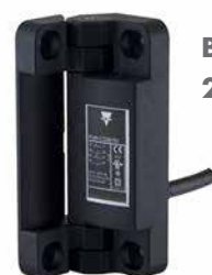
Back output 2mt. Cable