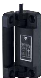
Top axial output 2mt. Cable