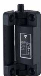
Top axial output M12 Connector

assured by inserting the appropriate safety plug (not removable) in the adjustment hole.